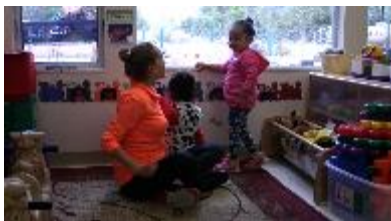
Teacher Welcomes a Child