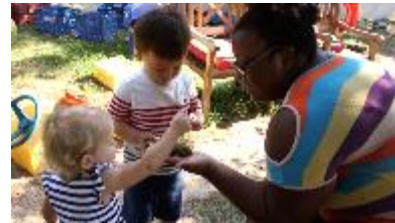
Dirt and Grass