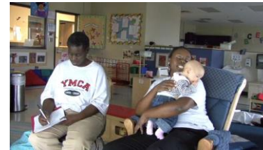
Teacher Document Observations

All Infant/Toddler Resource Guide Videos