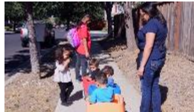
Walk to Park